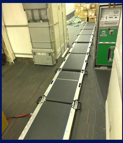
Cargo in Cabin Operation Reduced unload time from 3 hours to 1 hour and the crew from 15 to 4 people.

See how TISABAS will benefit your operation.